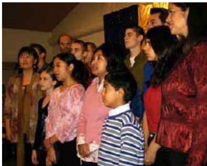
Families sing during Dedication Ceremony